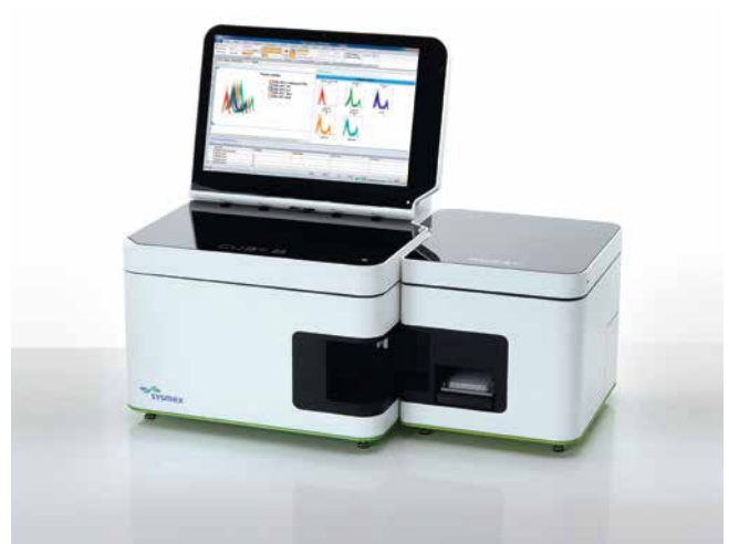
CyFlow Cube 8 with Robby 8 Autoloading Station