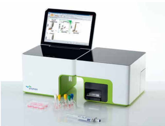
CyFlow Cube 6 with Robby 6 Autoloading Station

combines a flow chamber with a piezo element, including electric activation. This cell sorter lets you sort cells or particles stably and non-destructively with high yield and purity. It works as a closed system and, in contrast to typical droplet sorters, the process is smooth with reduced mechanical stress. This is important when working with fragile cell types, such as neuronal stem cells. As a closed sorting solution, it is aerosol-free so you avoid biohazardous exposure yet lets you deliver sterile sorting of viable cells for subsequent cell culture. For operator safety you can place your CyFlow Cube 8 Sorter under a standard clean bench – this is possible thanks to its small footprint with no external components (see page 8).